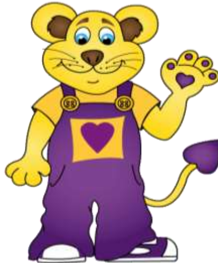
Ditto is Bravehearts' mascot lion cub for lower primary and childcare education